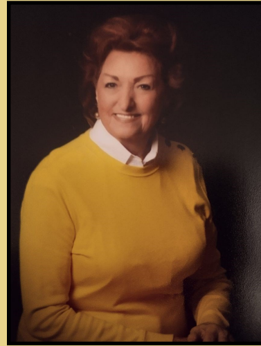
IN MEMORY OF ALMA KIDD