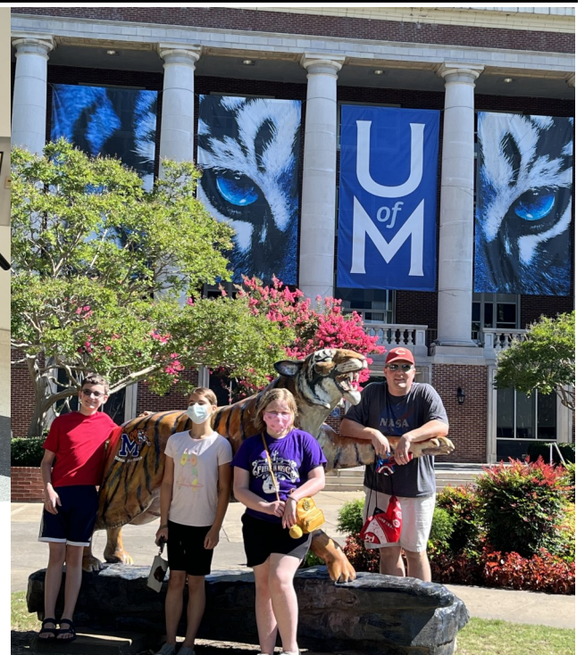
Please enjoy photos of the Chi Rho Youth Mission Trip to Memphis, TN