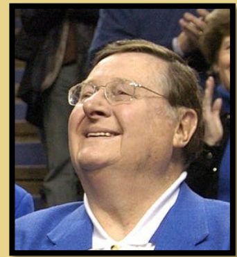
JOE B. HALL 1928 - 2022