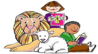
Worship and Wonder

CHILDREN'S CHOIR PRACTICE NEW UNIT—TEACH US TO PRAY