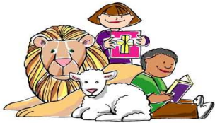
Worship and Wonder

Worship an Wonder Storyteller Training, March 10, 10 a.m.-2 p.m., March 11 after church for lunch.